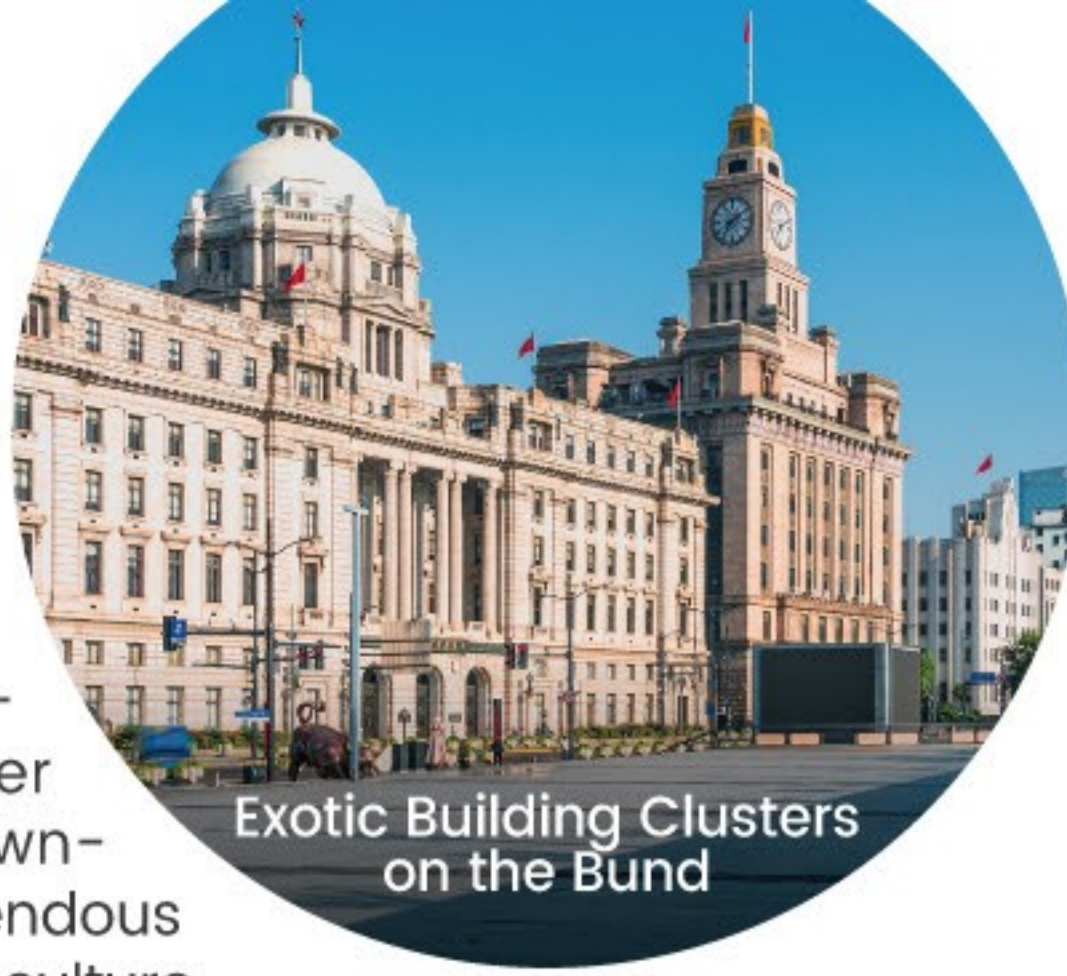
Exotic Building Clusters on the Bund