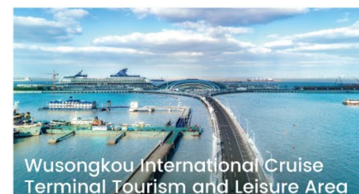
Wusongkou International Cruise Terminal Tourism and Leisure Area

📍 Shanghai Songhu Memorial Park for the War of Resistance Against Japanese Aggression No. 1, Youyi Road, Baoshan District