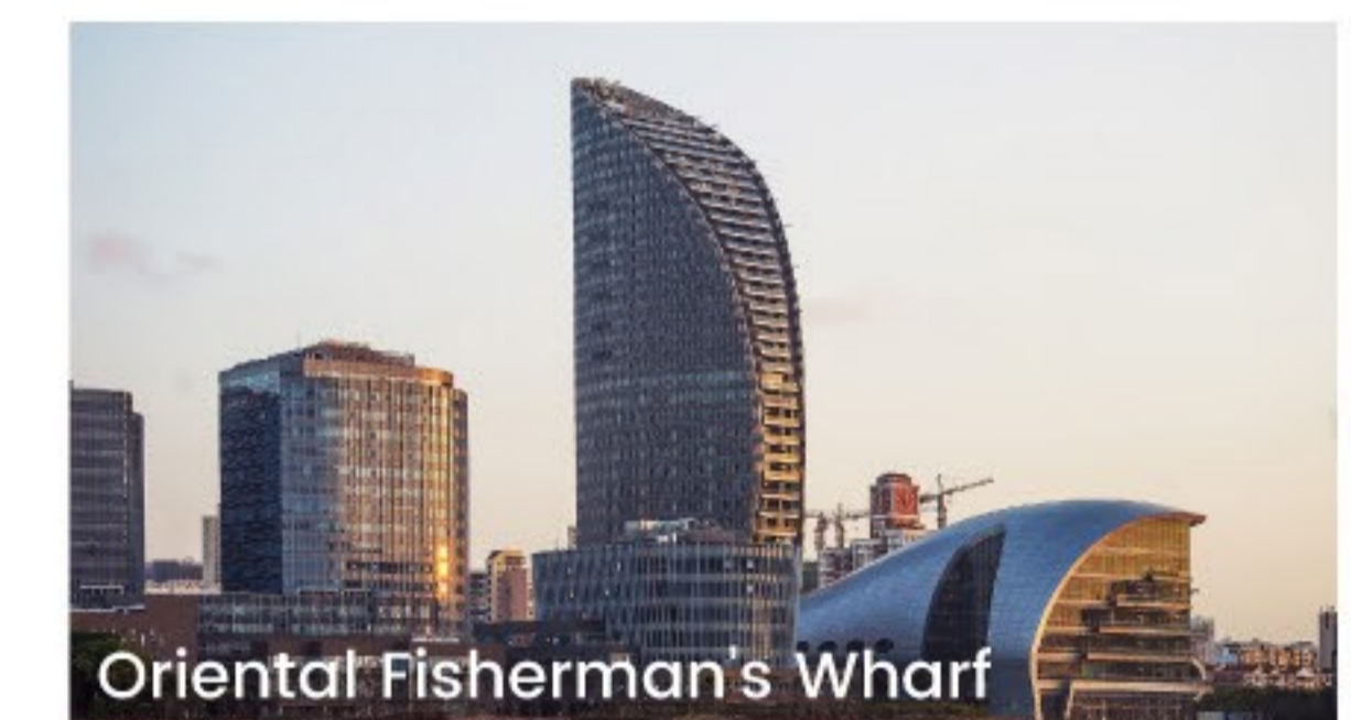
Oriental Fisherman's Wharf

📍 Oriental Fisherman's Wharf No. 1088, Yangshupu Road, Yangpu District