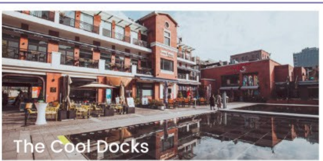
The Cool Docks