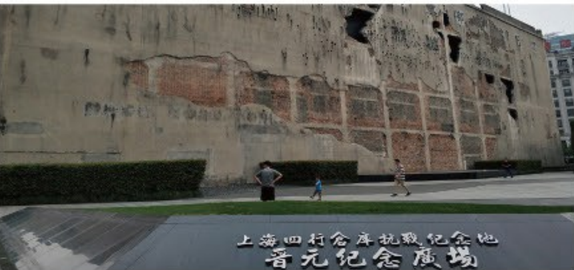
Shanghai Sihang Warehouse Memorial Hall

It is the largest astronomy museum in size around the world. As a large-scale popular science museum, Shanghai Astronomy Museum (a branch of Shanghai Science & Technology Museum) provides a panoramic view of the vastness of the universe and offers visitors a journey of multi-sensory exploration.