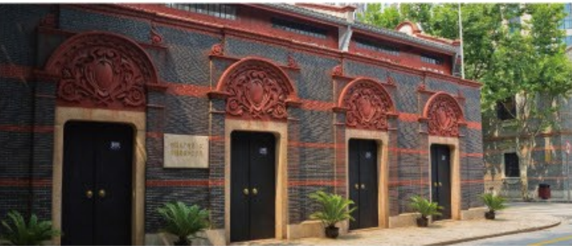
Memorial of the First National Congress of the Communist Party of China

Visiting great exhibitions, museums and cultural venues in Shanghai has become a reason why tourists love this city. Shanghai's museums are second to none in the country in terms of number, variety and the fields covered. They create a background color for the city's cultural appeal.